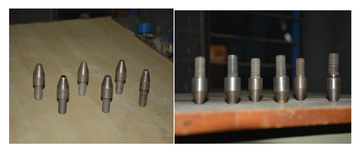
Fig.1 shows the different sizes of diameter of the Abrasive jet nozzle