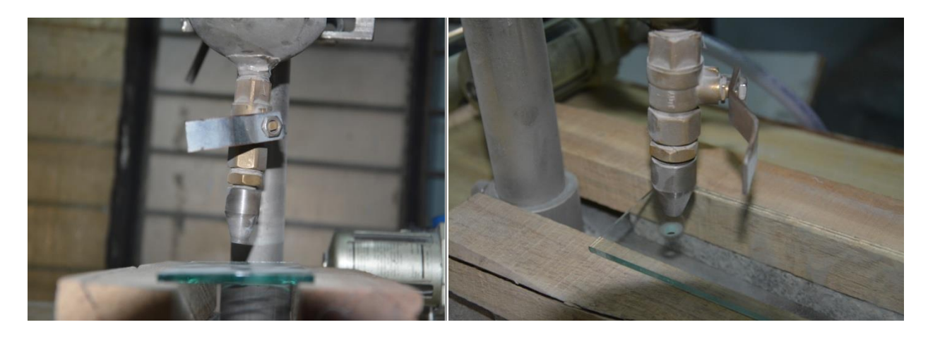
Fig. 3 Glass specimen's setup machining of holes obtained with different process parameters.

Figure , shows test specimens after the drilling process, carried out under different process conditions.