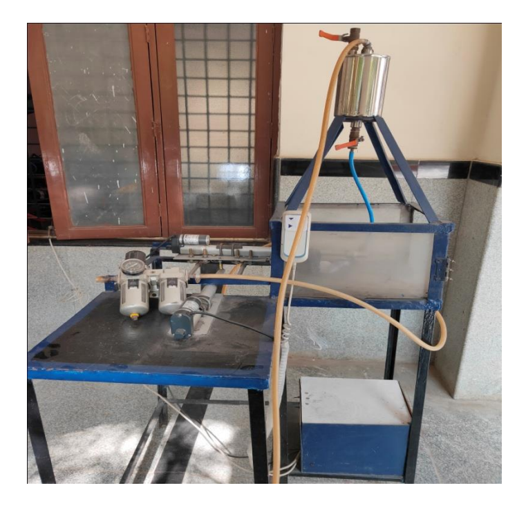
Fig. 2 Abrasive jet machining setup